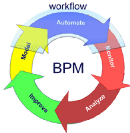
Figure 2: Relation between BPM and WFM

Reference model of a WFMS as defined by Workflow Management Coalition (WFMC) is shown below (Figure 3).