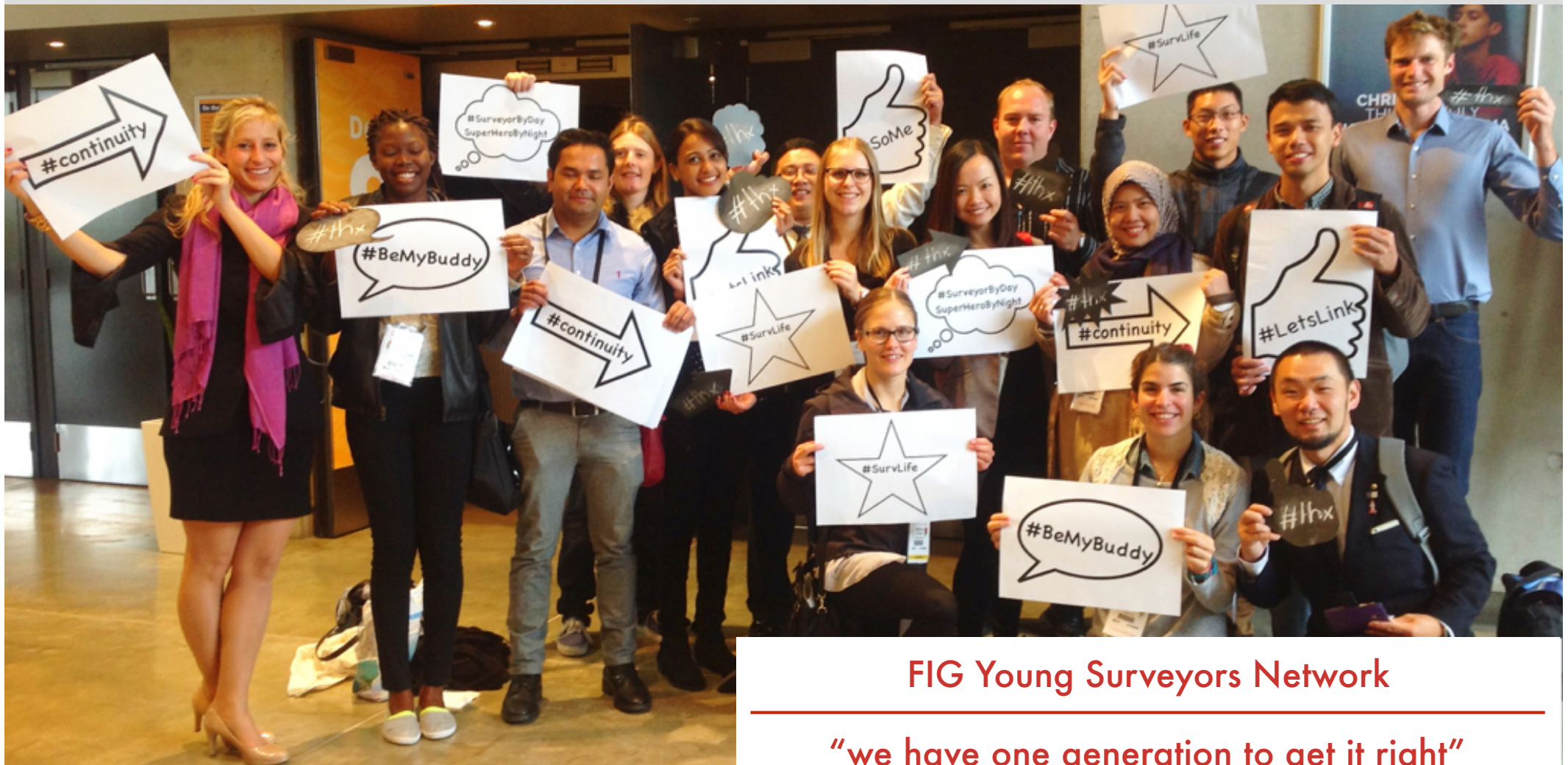
FIG Young Surveyors Network

Social Tenure Domain Model Trained Trainers Overview (2013 - 2017)