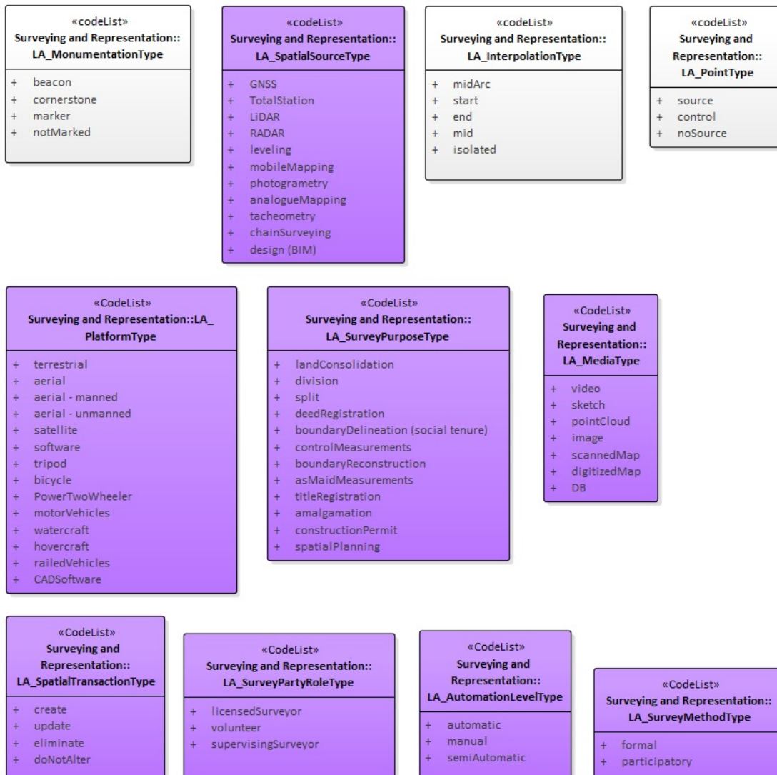
Figure 4 - Code Lists for Surveying and Representation Subpackage

LA_MonumentationType: the LA_MonumentationType code list includes all the various monumentation types, such as beacon or marker, used in a specific land administration profile implementation. The LA_MonumentationType code list is required only if the attribute monumentation in LA_Point class is implemented.